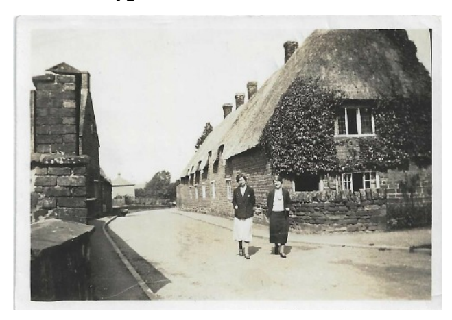
Blue Row, Church Lane - demolished c 1930

If you have any photos, documents or recollections that may be of interest, please contact