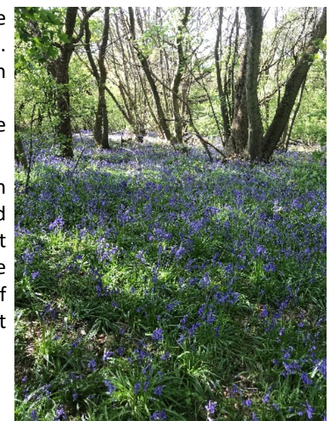
Cont. on page 18

First May Walk - Meeting outside the church in Everdon, heading out of the village round the back of the church, skirting the cricket club, allotments and a few chickens we headed off towards the ruined hamlet of Snorscombe. Turning left before the hamlet we headed towards Everdon Stubbs.