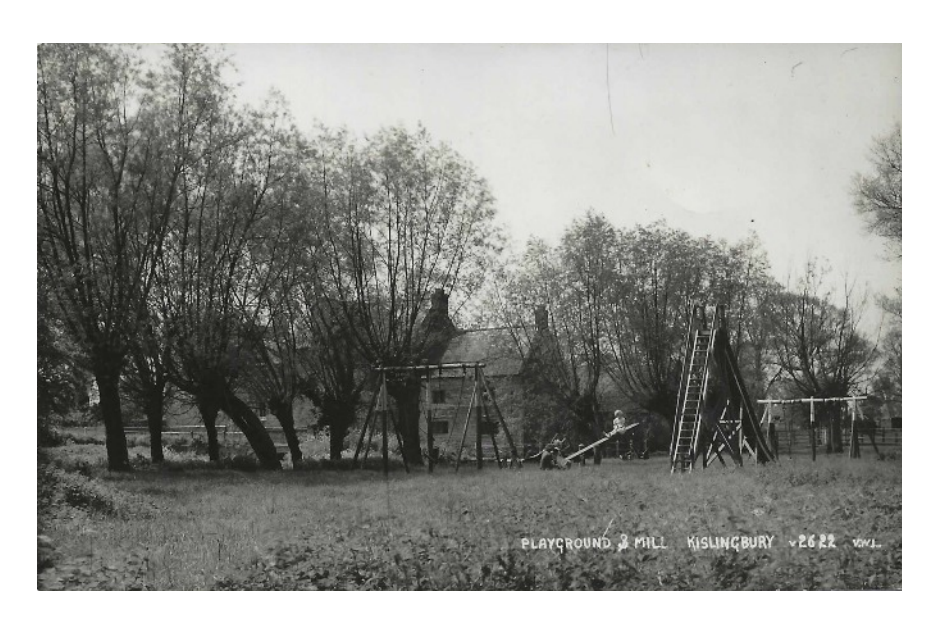
Playground at The Mill c 1950s