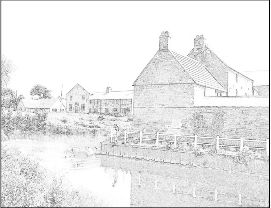
The Mill Pond